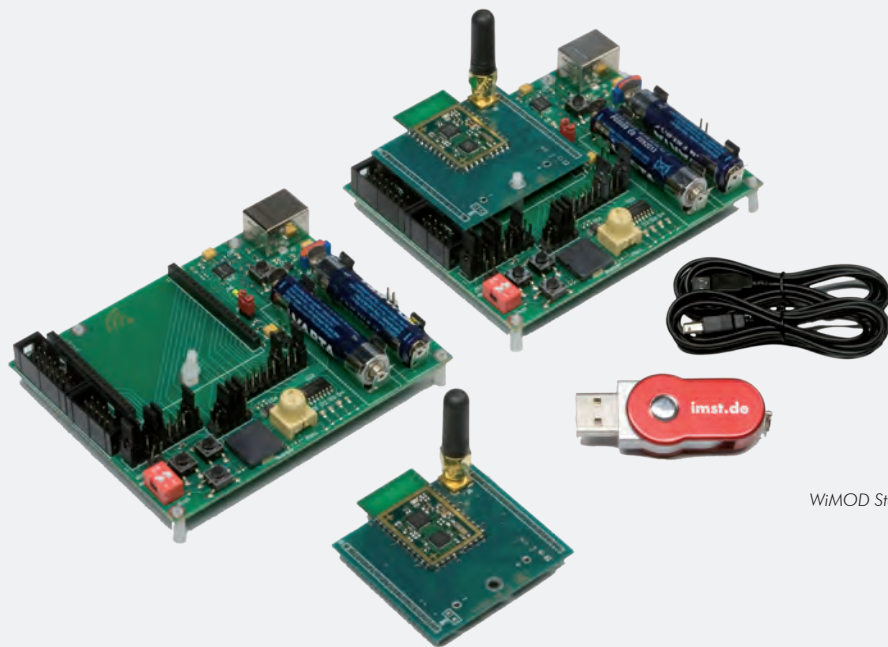
WiMOD Starter Kit