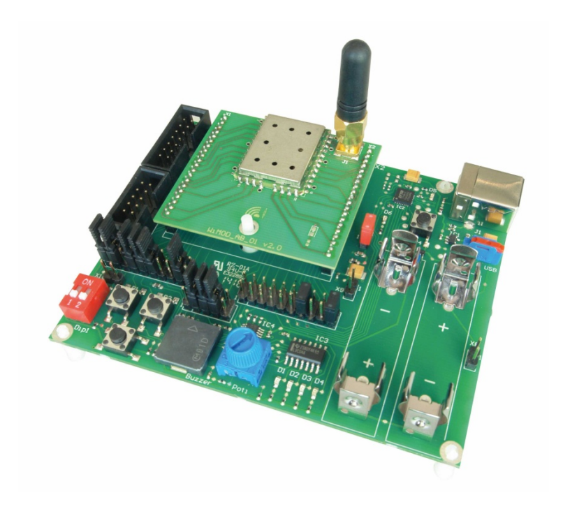
Figure 1: WiMOD iM282A and Demo Board